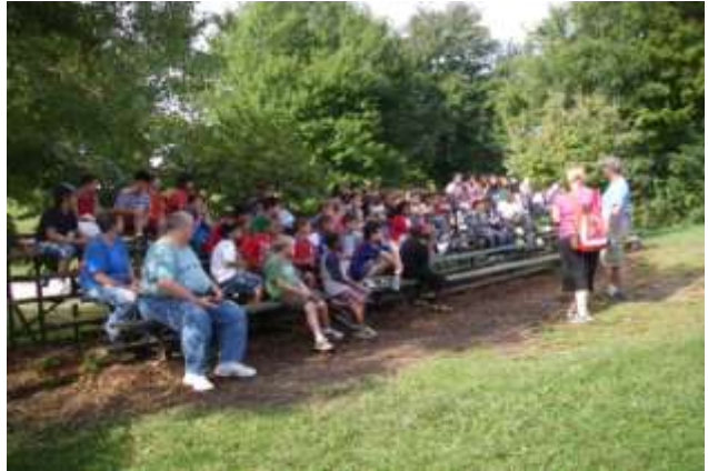
September 24, 2009 Padonia International Elementary School Students at Genesee Valley

On September 24, 2009 members and friends of our Club met at Genesee Valley Outdoor Learning Center in northern Baltimore County, to enjoy a day with 53 fifth grade students from Padonia International Elementary School. The trip has become a highlight for students and faculty as a day of building self-confidence and team spirit. The event was moved from spring to fall so the benefits could be carried over into the classrooms throughout the school year. Thanks to all the volunteers that helped make the day a success. Papa John's and Sam's Club were instrumental in providing lunch.